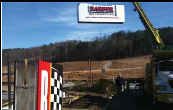
The Barber entrance sign being moved further up Barber Parkway to make room for the widening of Rex lake Road that is scheduled to be completed in 2011.

We would like to extend a warm welcome to our friend and neighbor, the Hampton Inn at Leeds, which is set to open February 10th, 2010. We look forward to working with such an excellent facility in the future!