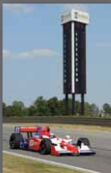
Indy star, Hideki Mutoh took to the track during the IRL test last spring.