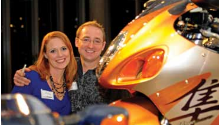
BVMM Volunteers enjoy a dinner in their honor for all of their hard work in 2009.

D o you enjoy being surrounded by friendly, interesting people? Does spending time interacting with others from around the globe that share the same interests sound like a good time to you? If so, then we have just the place for you. We, here at the Barber Vintage Motorsports Museum, have a wonderful group of volunteers and we would like you to join us!