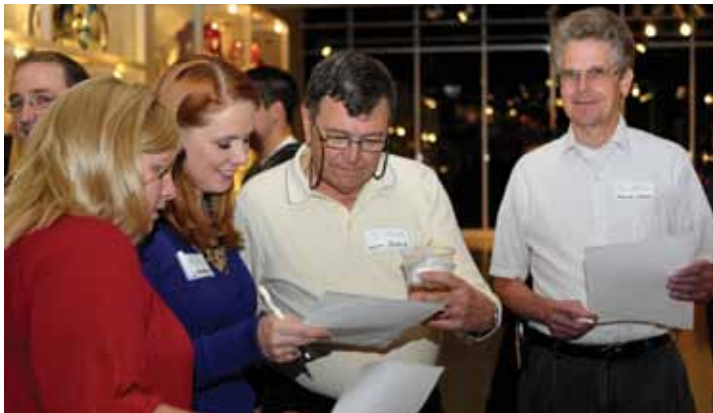
Volunteers hard at work during the scavenger hunt at the annual Volunteer Appreciation Dinner

Volunteering is a vital part of the success of the museum and we value everyone who offers up their precious time to help us preserve the history of Motorsports. Our volunteers enjoy an array of benefits in exchange for donating their time. For example, during race weekends, volunteers receive a complimentary ticket to the race. In addition, we offer several opportunities for our volunteers to come out and enjoy the museum and interact with one another. And for those of you who are not the “gear head” type, don’t worry! We have several volunteers here at the museum who simply enjoy being in the beautiful environment and that love being surrounded by friendly faces.